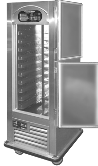
Half Length Door Model RAC37-HHS